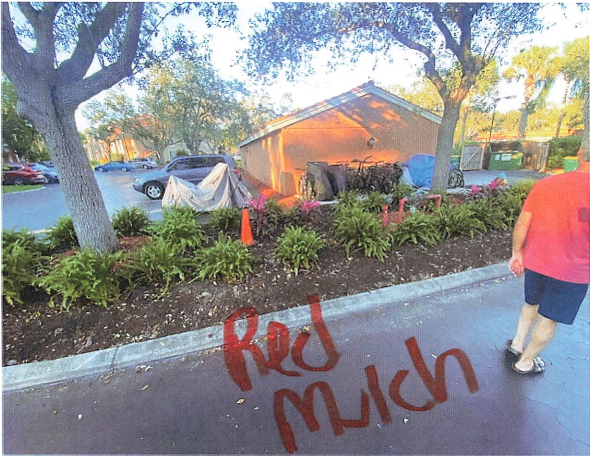
In planting bed: Install 35.00 bags of red mulch.